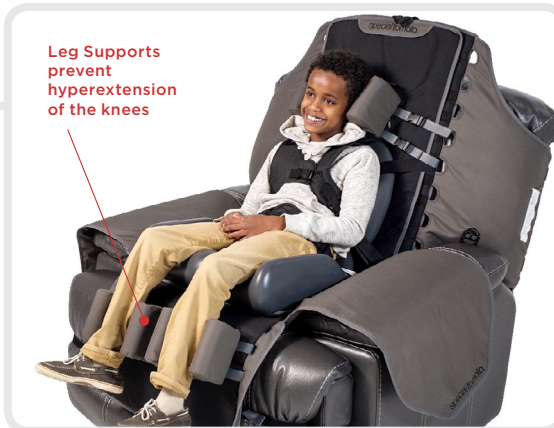
Shown with optional seat & back liners