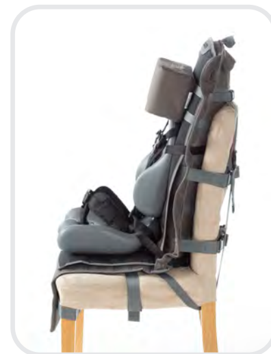
The Out & About Seat accepts seat & back liners