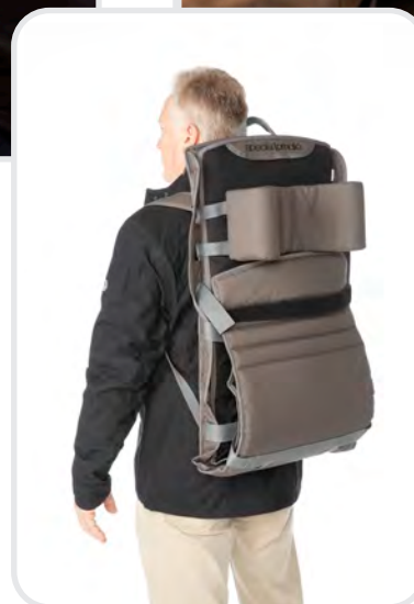
Ready for travel as a backpack