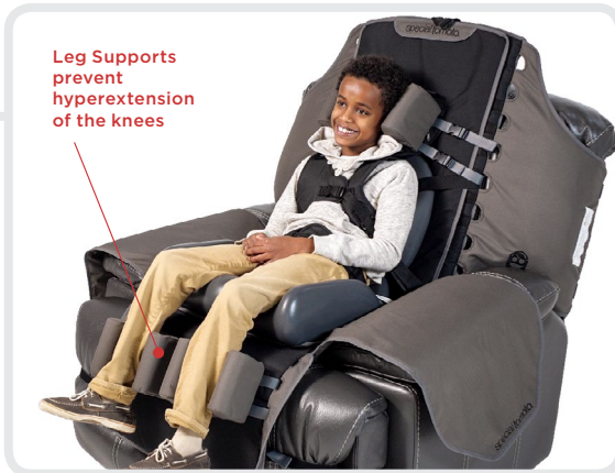
Shown with optional seat & back liners