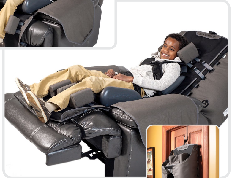
RSS folds and stores easily