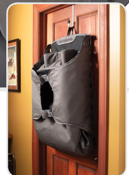
RSS folds and stores easily