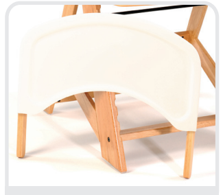
Wooden Tray (with Cover)