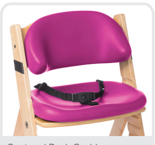
Seat and Back Cushions