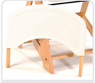
Wooden Tray (with Cover)