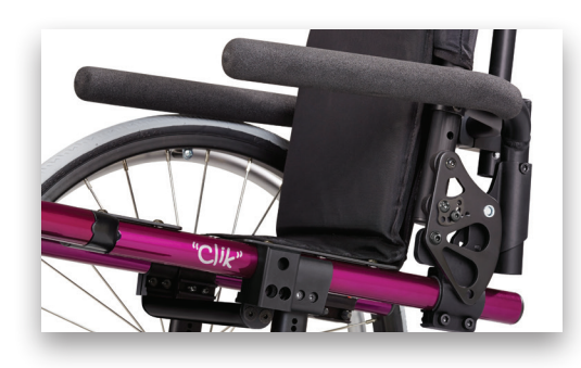
Clik's unique swing away armrest allows for independent angle adjustability, while integrated into the backrest for easy growth. Your arm is always where you need it.

Whether setup in mid-wheel for the smallest riders or to help promote and teach the balance and wheeling skills that encourage confidence to overcome everyday obstacles and terrain. Be Dynamic.