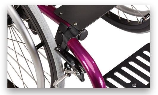
Compound offset frames ensure your kid has the fit they need. More room for abducted positioning, AFO's and braces.