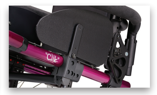
The replaceable cross tube with TAPER LOK increases Clik's rigidity resulting in an easier to push chair. Optional integrated receivers use less space so you can get everything in the right spot. The first time.