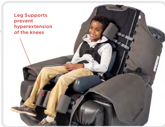
Shown with optional seat & back liners